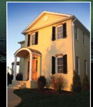
Hollingsworth Park at Verdae Classically styled homes from the $300s (864) 329-8383 verdae.com